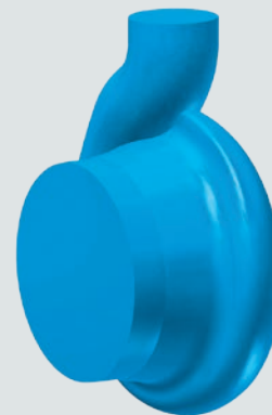
Patented axial spiral

channels that the solids have to pass through nor are there any radial gaps between the pressure and suction sides that could be clogged by fibers and otherwise obstruct the pump.